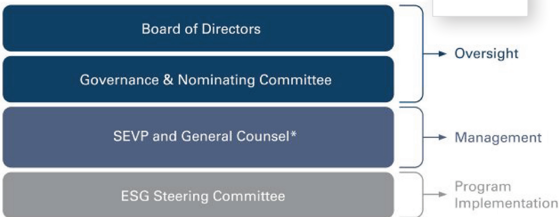
Figure 2 Global Payments, Inc. proxy statement filed March 19, 2021. See full proxy statement at bit.ly/3naXDN6 .

Figure 2 is a visual layout of ESG governance in Global Payments’ 2021 proxy.